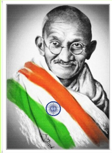
Mohandas K. Gandhi, the Mahatma