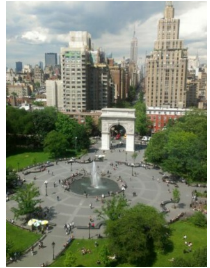
View of Washington Square Park from the IPA convention venue

The program for our 37 th annual convention consists of a diverse group of scholars, each with a unique contribution to our continually expanding knowledge of cultural, historical and societal motivations. 50 presentations are scheduled over the three day period with featured speakers on Wednesday June 4 and three continued on page two