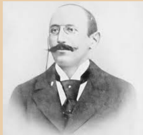
Alfred Dreyfus (1859-1935)

My three studies of Alfred Dreyfus and his family are based on analysis of books about them as well as on letters Alfred exchanged with his wife Lucie while he was kept in solitary confinement and imposed silence on Devil's Island. The letters yield more than historians have seen so far. Commentators have made nothing of the lack of sequence, the absence of narrative, and the repetition of words, phrases and cries of painful loneliness. They have overlooked the intimacy of the couple's love, their discussions on education, and their mutual dependence on their two families, Alfred's own and Lucie's Hadamard connections. These